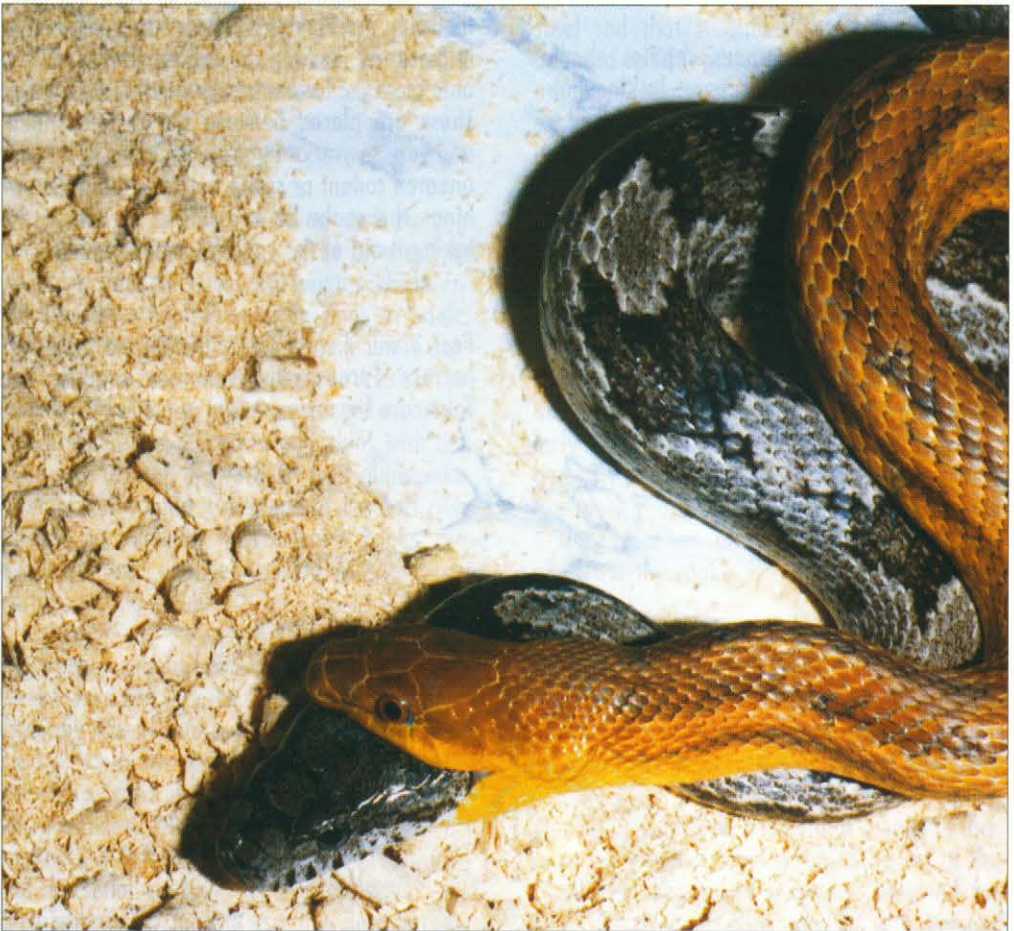
Neckbite during mating.

Family Colubridae , Subfamily Colubrinae . The genus Elaphe is comprised of about 40 species, including Elaphe obsoleta which contains five subspecies: Elaphe obsoleta lindheimeri , Elaphe obsoleta obsoleta , Elaphe obsoleta quadrivittata ,